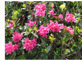
Botanical Trail, Latemar

The botanical path Dos Capèl - Gardonè presents an extraordinary blossom of rhododendron, wood anemones, stone-breaks, gentians, green alders and juniper bushes. Latemar's rocks and fossils in the Geological Trail from Passo Feudo tell the tale of a tropical sea and large volcanoes in the area that is now the Dolomites.