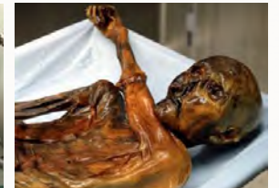
Ötzi the Iceman, Museum of Archaeology in Bolzano