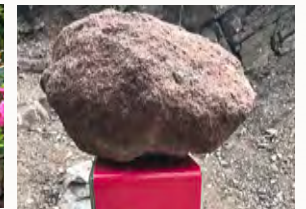
Geological Trail, Latemar