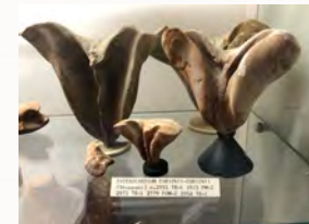
Fossils, Paleontological Museum, Cortina

The permanent exhibition at the South Tyrol Museum of Archaeology in Bolzano, Italy includes Ötzi the Iceman: a mummy from the Copper Age, 5300 years old.