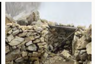
Trenches Open Air Museum WW1, Cinque Torri